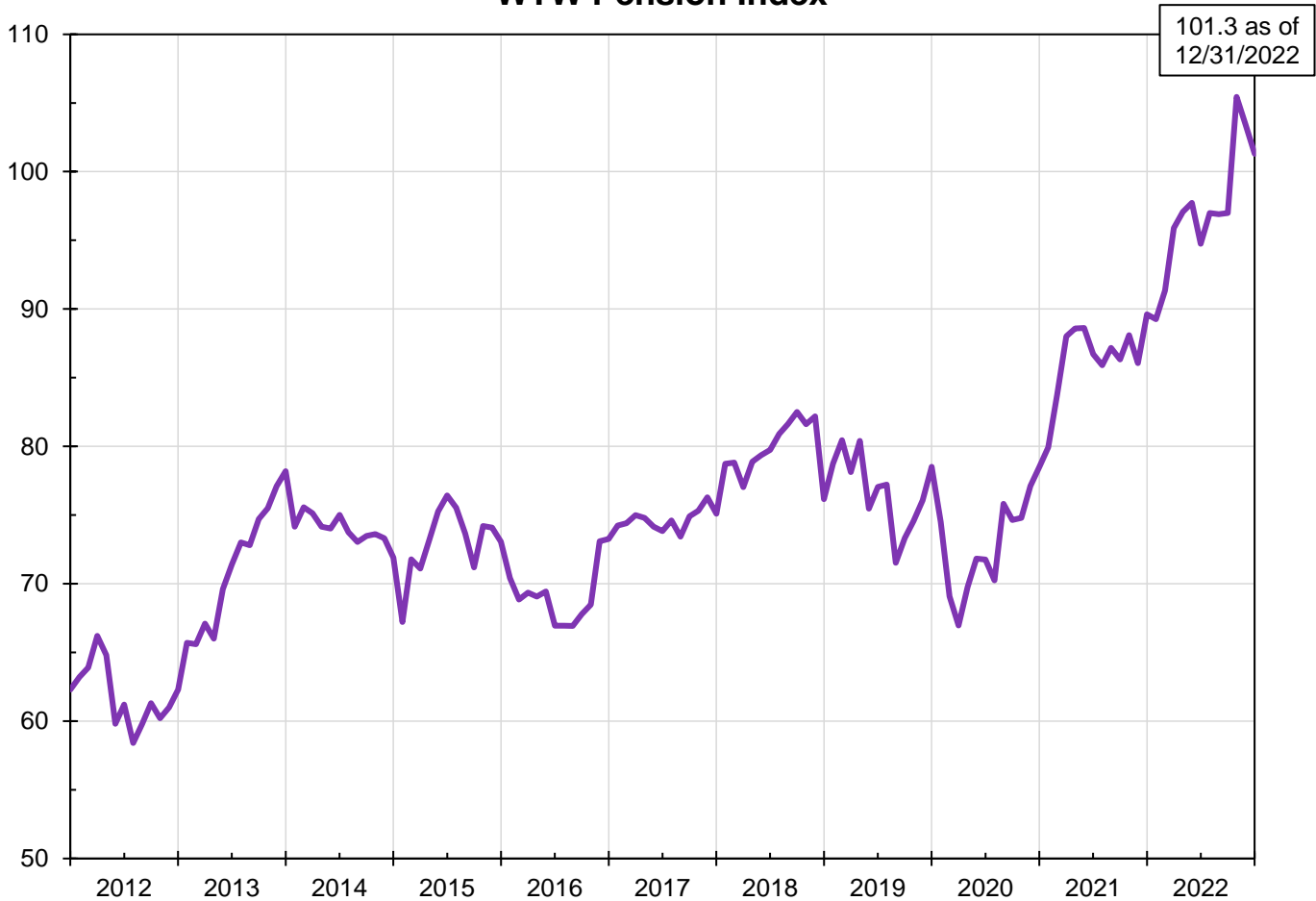
WTW Pension Index

The WTW Pension Index declined in December 2022. This month's change was a result of negative investment returns, partially offset by a decrease in liabilities due to an increase in discount rates. The end-of-December index level of 101.3 reflects a decrease of 2.0% for the month but an increase of 13.0% for the year.