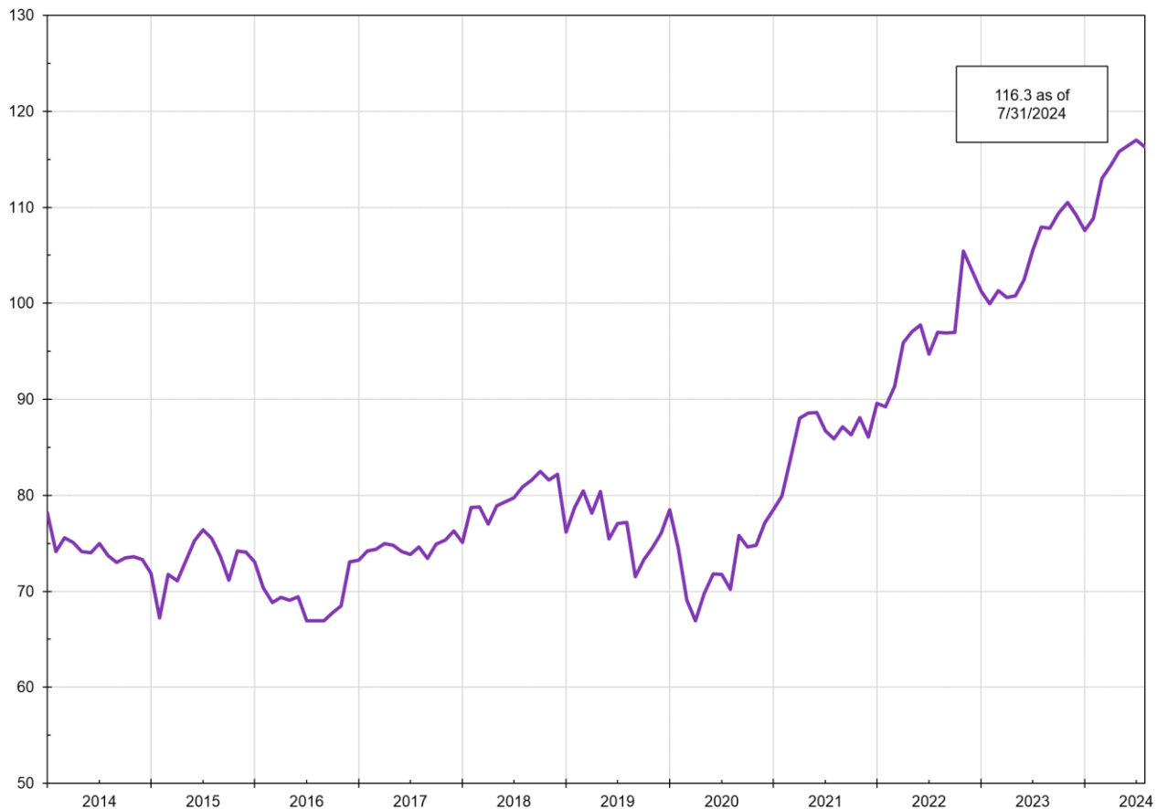
WTW Pension Index

The WTW Pension Index has decreased for the first time in six months in July 2024. Positive investment returns were more than offset by increases in liabilities due to decreases in discount rates, resulting in a July 31, 2024 index level of 116.3, a decrease of 0.6% over the prior month.