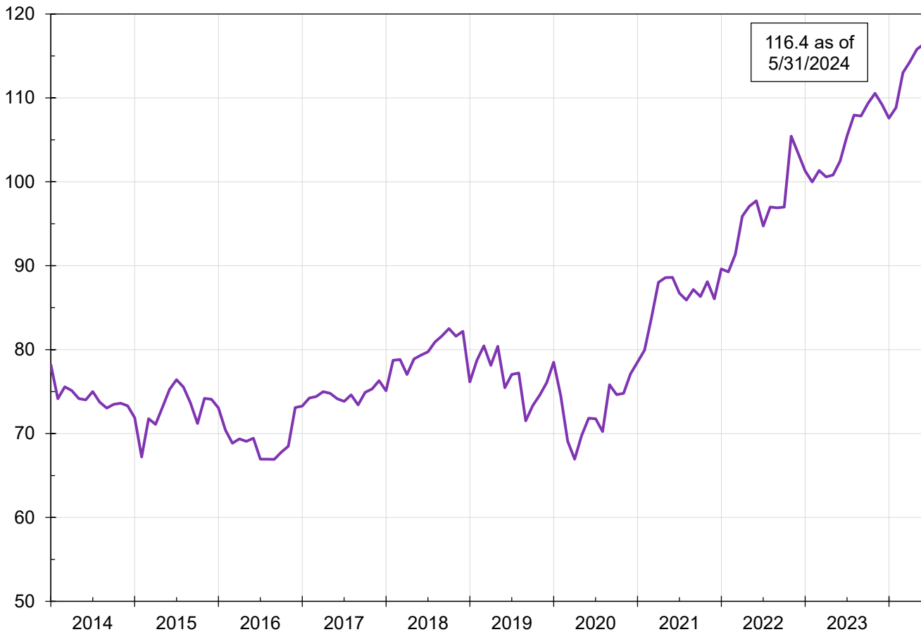
WTW Pension Index

The WTW Pension Index continued to increase in May 2024, reaching the index's highest level since late 2000. Positive investment returns were partially offset by increases in liabilities due to decreases in discount rates, resulting in a May 31, 2024 index level of 116.4, an increase of 0.5% over the prior month.