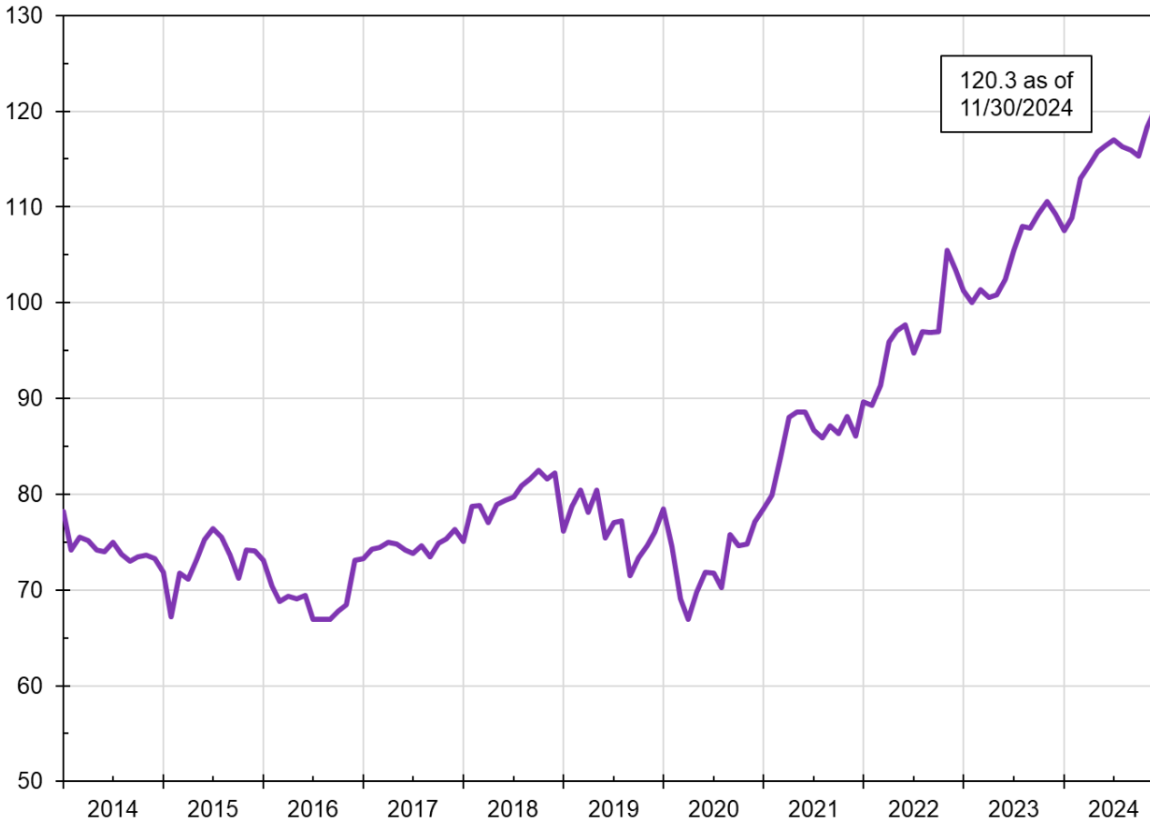
WTW Pension Index

The WTW Pension Index has continued its rise to the highest value since late 2000 for November 2024. Positive investment returns more than offset increases in liabilities due to decreases in discount rates, resulting in a November 30, 2024 index level of 120.3, an increase of 1.7% over the prior month.